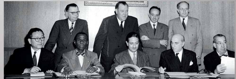
Convention on the Prevention and Punishment of the Crime of Genocide Paris, 9 December 1948 [I19]