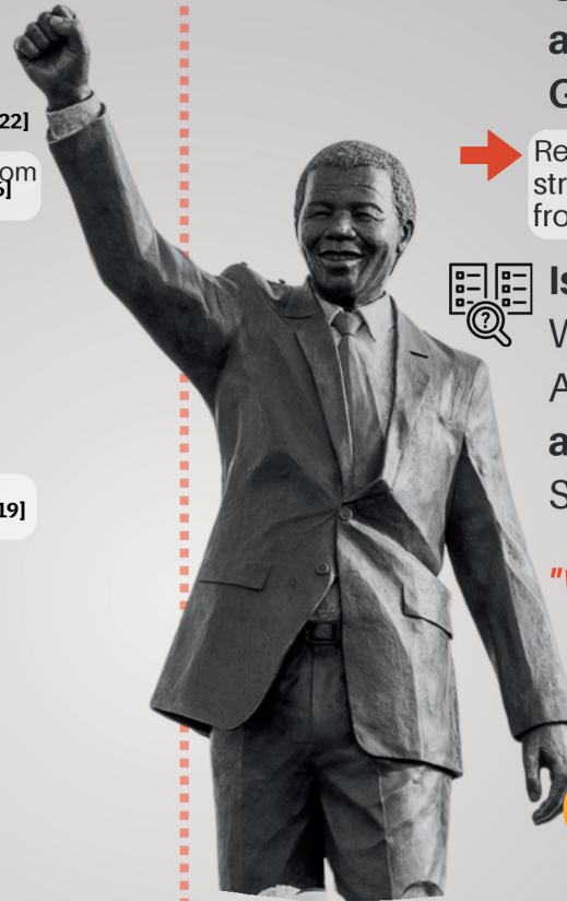
[Giant statue donated by South Africa - on Mandela square in Ramallah, Palestine] [I18]

Did you know, the BBC did not broadcast South Africa's case on the 11th of January in 2024? However, they did a full live-stream of the Israeli defense on the 12th. [I16]